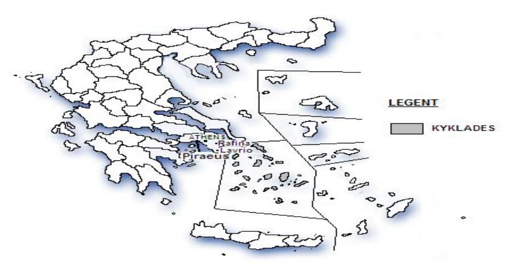
Figure 1. Greek territory and Kyklades Prefecture

In our research, we have taken into consideration 22 islands-ports of the Kyklades prefecture, which are served by the main costal shipping lines (without taking into consideration the local lines) and are the following: Naxos, Andros, Paros, Tinos, Milos, Kea, Amorgos, Ios, Kythnos, Mykonos, Syros, Sifnos, Thira, Serifos, Sikinos, Anafi, Kimolos, Folegandros, Irakleia, Donousa, Schoinousa, and Koufonisia (Figure 2).