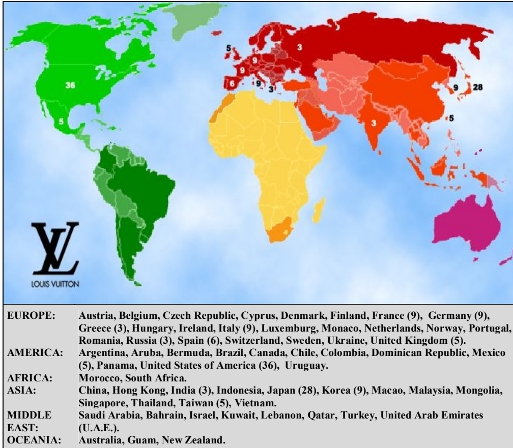
Table 4: Markets with Louis Vuitton brand presence (year 2009)