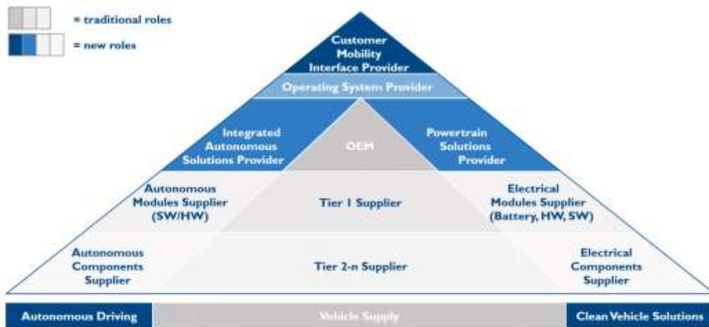
Figure 2. Diagram of changes in the pyramid of suppliers to vehicle manufacturers in relation to this with the entry of new technologies