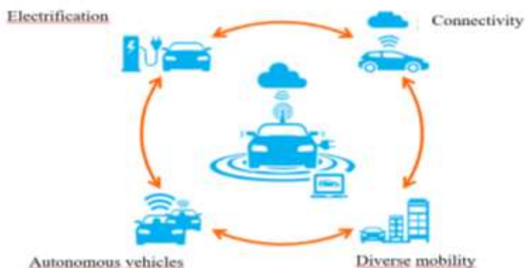
Figure 1. Breakthrough technological trends in the automotive industry in the perspective of 2030