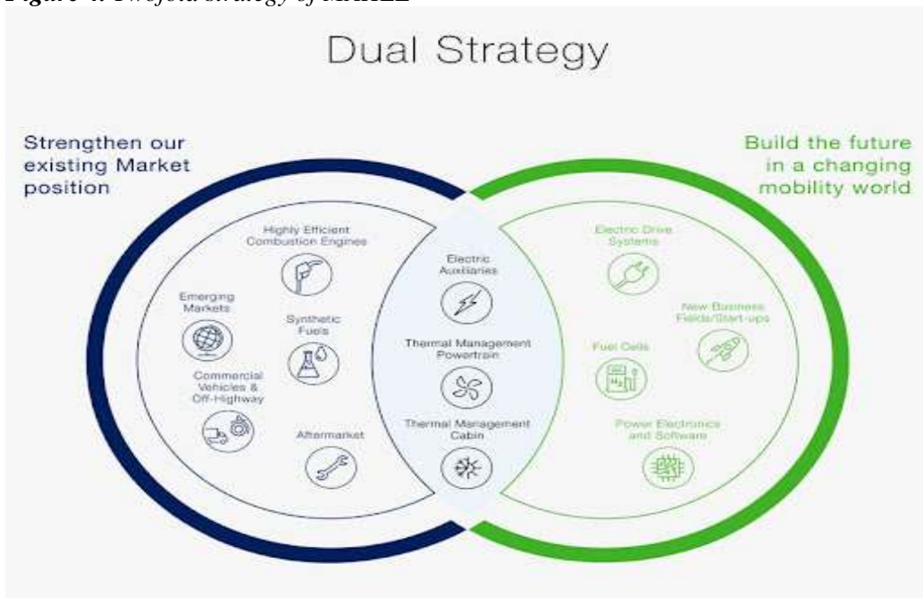
Figure 4. Twofold strategy of MAHLE

The MAHLE Group is a leading international supplier of products to the automotive industry and a pioneer in mobility for the future. It implements the dual strategy of today and tomorrow, which includes strengthening the current market position and building the future in the changing world of mobility (Figure 4).