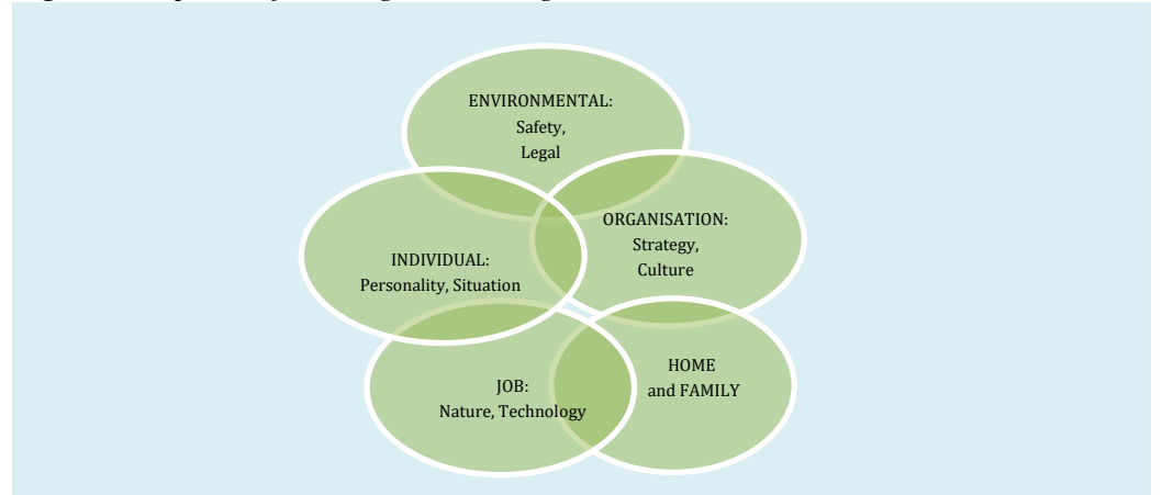
Figure 1. Aspects influencing teleworking