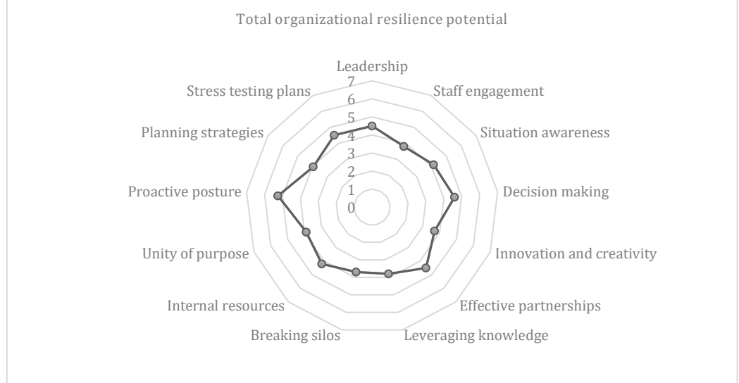
Figure 3. Key indicators of assessment of the total organizational resilience potential.

To better illustrate the data obtained by flying personnel, ground personnel and as a whole, with 13 indicators of resilience, the results are presented on radar charts for the whole – Figure 3, for flying personnel – Figure 4 and for ground personnel – Figure 5, respectively.