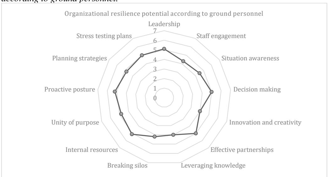
Figure 5. Key indicators of assessment of the organizational resilience potential according to ground personnel.