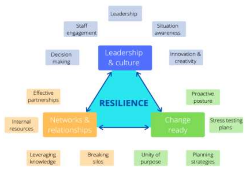
Figure 1. Key attributes and indicators of resilience.

participation of staff in simulations or scenarios designed to practice response arrangements and validate plans) (Brown et al. , 2017).