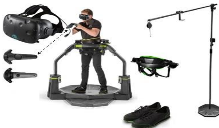
Figure 3. An overview of the dynamic module

Allowing this type of manoeuvres would require increasing the number of moving parts of the treadmill and thus reduced support for people who run inside it. According to the manufacturer's assurances, dynamic walking as well as running on the treadmill is completely safe, because the treadmill is equipped with a hip belt that helps maintain body stability and balance in situations of dynamic turns and changes in the user's direction of movement. In order to conduct research on the visualization system based on VR goggles, the research environment (dynamic module) was integrated with the documentation workstation (static module). The training participant can move in virtual reality using the Omni treadmill and the HTC Vive Pro VR headset. The concept of the dynamic module is shown in Figure 3.