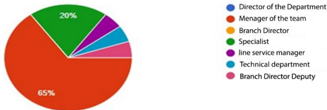
Figure 1. Graphical structure of the research sample

equal to) 75.0% of the observations, and the maximum value. The percentage of people choosing a particular assessment of a given answer variant is also presented. All calculations were made with the R package, version 3.5.3.