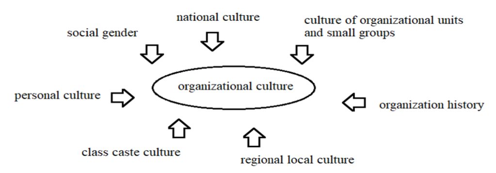
Figure 1. The influence of external cultures on the culture of the organization

Source: Own study based on Koźmiński A.K., Jemielniak D., 2011. Management from scratch, Edition. II, Oficyna, Warsaw, 271.