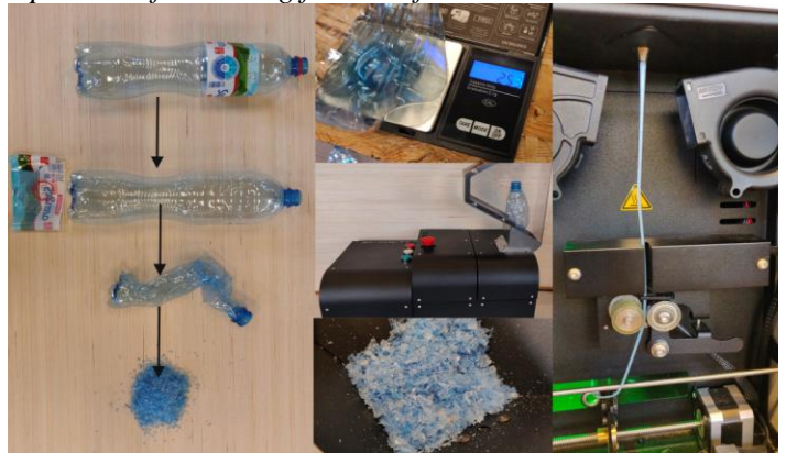
Figure 2. The process of obtaining filament from PET bottles

Initially, the waste was cleaned, and plastic or paper stickers were removed. In the next step, the bottles were thermally shrunk. The shrink bottles were fed to a milling machine (SHR3D IT) which ground them to the appropriate fraction. After gaining one kilogram, the fraction was dried and fed to a filament making machine (Composer 450). After obtaining the filament, test helmet bands were printed.