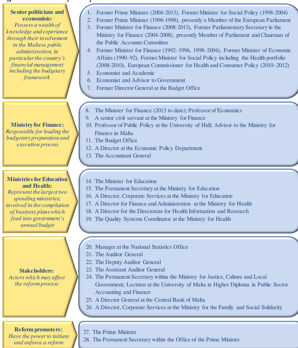
Figure 1. Research participants