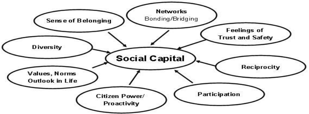
Figure 1. Trust is an essential component of social capital

According to Catwell (2016), leadership is defined as the behavior of the individual that influences a new structure in a social system by changing the purpose of, configuration, procedures, process input and output a system. According to Robbins (2008), leadership is the ability to influence a group to achieve a vision or a series of specified goals.