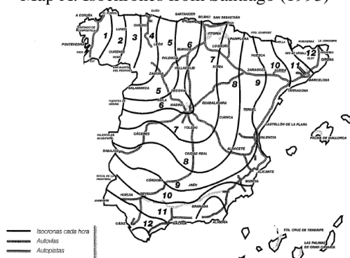
Map A: Isochrones from Santiago (1993)