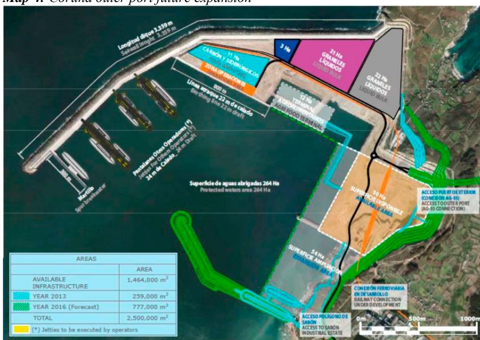
Map 4: Coruña outer port future expansion

The 2000-2006 Cohesion Fund financed Stage 1 (construction of a seawall measuring 3,360 m, a breakwater measuring 215 m, a quay measuring 900 m, a port esplanade covering 150 hectares and road access to Sabón industrial estate) with aid of €257.54 million. For Stage II (involving the construction of an additional seawall measuring 391 m), the 2007-2013 Cohesion Fund has provided additional aid.