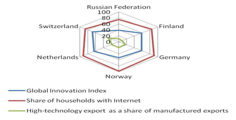
Figure 2. The Share of Households with Internet, Global Innovation Index, High-Technology Exports: Russia vs Europe

Thus, broadband penetration across Russia will enable the use of digital services in many spheres. This allows stores, salons and services to conduct cashless payments, reduces the cost of printing money, and contributes to formal economy. The digital realm can generate new jobs across the country. However, Russia is lagging behind in certain apects of digitalization.