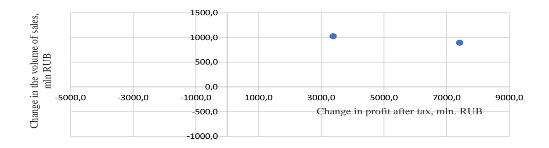
Figure 3. Financial performance of the joint venture