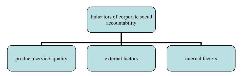
Figure 2. Groups of corporate social responsibility indicators

The above analysis of the activities of a number of companies to identify and classify the indicators of a company's corporate social responsibility into three groups was used (Figure 2).