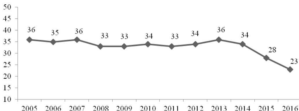
Figure 1. Share of imported food products in food retail, in percentages